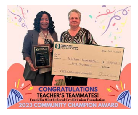
2023 Franklin Mint Federal Credit Union Community Champion Award