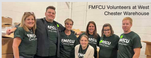
FMFCU Volunteers at West Chester Warehouse