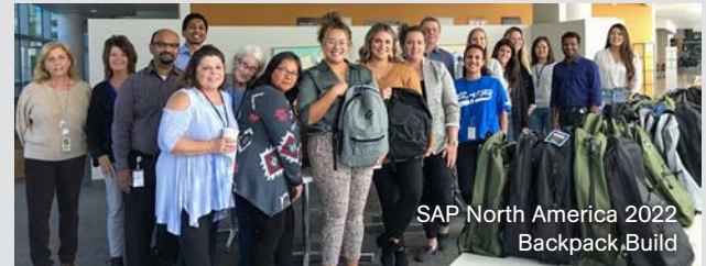
SAP North America 2022 Backpack.Build

➤ Groups of employees from corporations (i.e. The Boeing Company, CIGNA, Franklin Mint FCU, GIANT, Nouryon, PECO, Pfizer, SAP, SunEastFCU, Vault Communications and more) performed community service at their site or at the Teachers' Teammates warehouse.