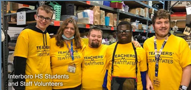
Interboro HS Students and Staff Volunteers

➤ Many groups of students volunteered at the warehouse for a Day of Service i.e. Villanova University, Widener University, Sacred Heart Academy in Bryn Mawr, Academy Park, Chichester, Delaware Co. Technical High School's Logistics and Inventory Management Program, Haverford, Interboro, Lower Merion, Penn Wood, Strath Haven, Upper Darby High Schools.