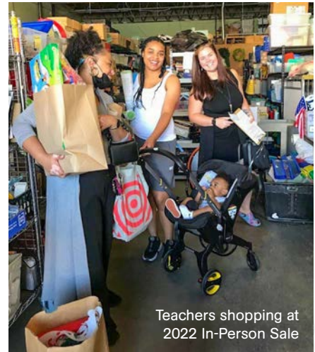
Teachers shopping at 2022 In-Person Sale