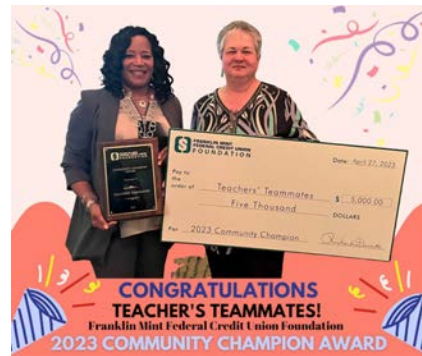
2023 Franklin Mint Federal Credit Union Community Champion Award