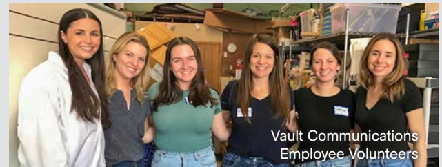
Vault Communications Employee Volunteers